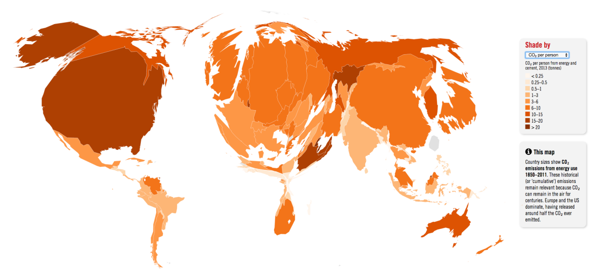
Cumulative CO2 emissions (1850–2011), shaded by CO2 per capita (2013). Source: CarbonMap.org26

extreme weather events like floods and hurricanes, increasing water scarcity, reductions in crop yields, and rising sea levels that impact coastal cities. Tropical countries share the commonality of being among the world's poorest while also being the most vulnerable to climate change, as illustrated in the map below.