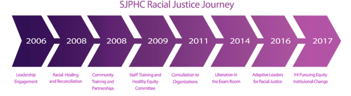
Figure 4. RacialRec timeline created from 2020 source data from the SJPHC.

In 2014, the "Liberation in the Exam Room" phase of work was introduced through a series of meetings with physicians and other medical professionals from Greater Boston to integrate racial justice frameworks into healthcare. This specialized programming was based on five steps created by the <u>Racial Reconciliation and Healing team</u> and the executive and medical directors at the SJPHC: 1) know the history of structural racism and white supremacy in medicine and public health; 2) know and train yourself, through key concept learning on racial identity, racism and health, racialized versus self-identification; 3) know your community's history and resources; 4) acknowledge implicit bias on your team; and 5) address structural racism in the exam room explicitly, through specific strategies—visual cues, ask better questions, deep listening, use measurement tools to advance racial equity.<sup>28</sup>