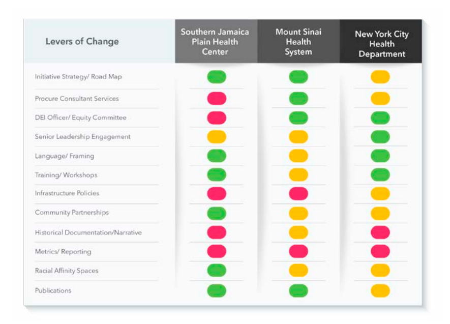
Figure 1. Organizational levers of change and a low-high application for each case study site. Red is low, yellow is medium, and green is high.

This research generated a codebook system (see Appendix 4) to evaluate field data and produce a data table of organizational levers of change to plot the application at each case study site. These levers are institutional activities, not individual behaviors, related to antiracist structural change (see Figure 1). The colors indicate the actions taken by the organization on a low, medium, or high degree of application.