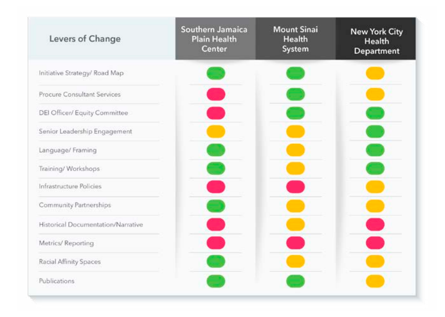
Figure 1. Organizational levers of change and a low-high application for each case study site. Red is low, yellow is medium, and green is high.