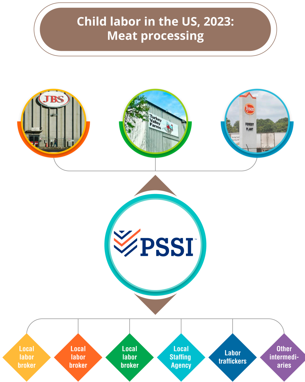
Figure 3. Child Labor in the Meat Processing Sector

The meatpacking cases arose from similar arrangements. There, companies like JBS Foods, the second largest beef and pork producer in the US, contracted with PSSI to provide cleaning services on the kill floors of its facilities. PSSI a "premier provider of food safety solutions," owned by private equity company Blackrock, 9 contracted a workforce from local labor brokers and staffing agency, including in towns with large numbers of immigrant children. The WHD investigation found children working in 13 facilities of multiple companies where PSSI served as the prime cleaning contractor.