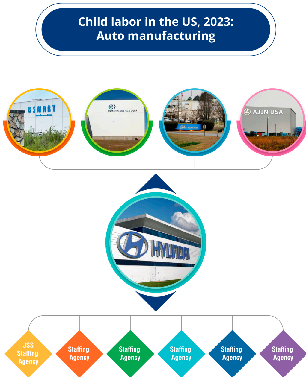
Figure 2. Child Labor in the Auto Manufacturing Sector

struggle to hit their production targets and keep their supply chains lean. Take the case of Hyundai Motor Group (Figure 2). Its Hyundai and Kia automotive divisions depend on dozens of manufacturing suppliers in Alabama, including two named in the aforementioned investigations: SMART Alabama and Hwashin. Those companies, in turn, use staffing agencies or labor brokers to find workers for its plant. Child workers came in through those doors, potentially through an additional layer of foreign recruiters and possibly, according to the Reuters reporters cited above, labor traffickers.