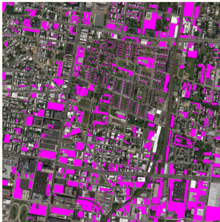
Image from the Research Institute for Housing America, “Quantified Parking: Comprehensive Parking Inventories for Five U.S. Cities.”

..... The Rocky Mountain Institute, in collaboration with the Robert Wood Johnson Foundation, is advancing the concept of MOD cities, where “MOD” means not only “modular” and “modifiable” but is also an acronym for “mobility-oriented development.” A key feature of the MOD city is the ability to physically transform depending on demand.