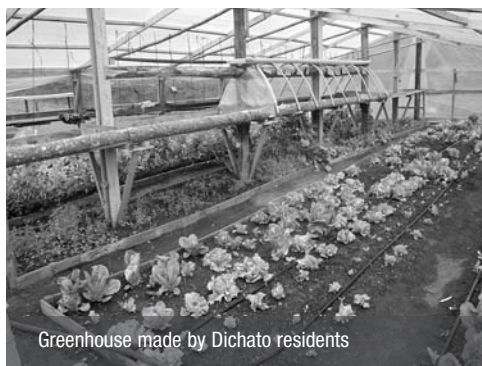
Greenhouse made by Dichato residents