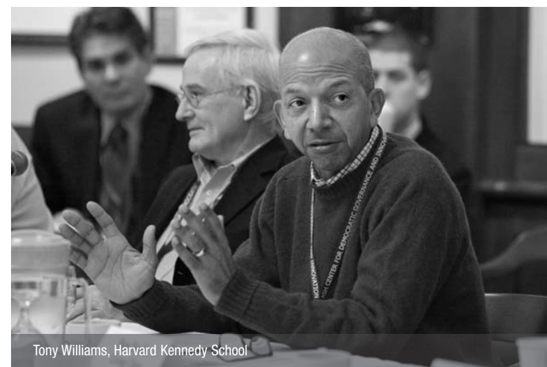
Tony Williams, Harvard Kennedy School

"We hope that UPAG is part of the new kind of guidance that senior city officials can use to generate, adapt, and implement in real time the fundamental and flexible reforms needed to forge a path to prosperity, equity, and growth," said Tony Williams, Ash Center affiliated faculty member and former mayor of D.C. UPAG is a joint venture of the Ash Center, Living Cities, and the Rockefeller Foundation.