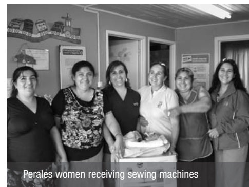
Perales women receiving sewing machines

This course is part of a larger effort of the Kennedy School to provide students immersive experiences to translate the skills they have learned in the classroom into practice. The Ash Center offers a host of travel and research grant opportunities through the Policy Analysis Exercise and summer internships. The Center's Summer Fellowship in Innovation places students in the offices of some of the country's most innovative municipalities to take part in key public policy initiatives and projects. Throughout the year, the Center also offers grants for students to research in the field. From exploring teacher retention in Pittsburgh to citizen receptiveness to new Dengue Virus medicine in rural Indonesia, such research projects demonstrate a wide range of creative scholarship from across the globe.