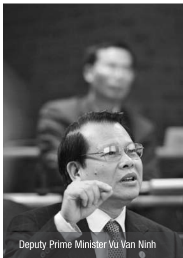
Deputy Prime Minister Vu Van Ninh

Vietnamese Delegation Explores Alternative Paths for Future Growth in Vietnam