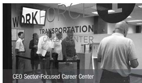
CEO Sector-Focused Career Center