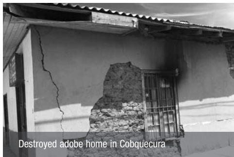
Destroyed adobe home in Cobquecura