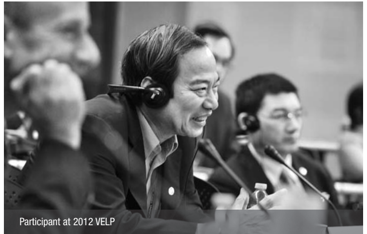
Participant at 2012 VELP

“It will mean, first and foremost, imposing discipline on both public- and private-sector entities through greater transparency and accountability,” stated a policy paper written for VELP. “Vietnam must move towards international standards of economic governance, including a clear separation between regulators and market participants, an unswerving commitment to a judicial system that is independent of politics, and public finance and fiscal policy reforms based on clearly enunciated rules and complete transparency.”