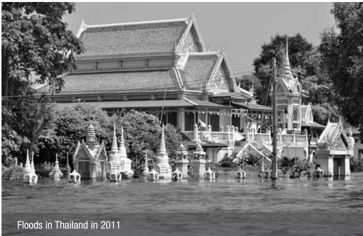
Floods in Thailand in 2011