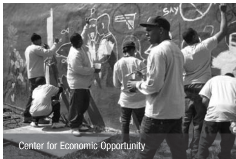
Center for Economic Opportunity