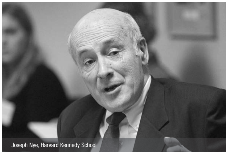
Joseph Nye, Harvard Kennedy School