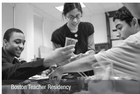
Boston Teacher Residency