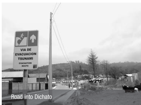
Road into Dichato

A key component of the Community Recovery course was to help residents of Cobquecura, Dichato, and Perales identify promising public and private grants for individuals along with start-up and existing businesses. As the grant application process can be overwhelming for even the most seasoned professional and many residents were