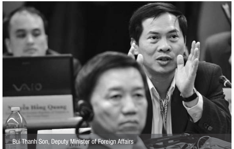
Bui Thanh Son, Deputy Minister of Foreign Affairs