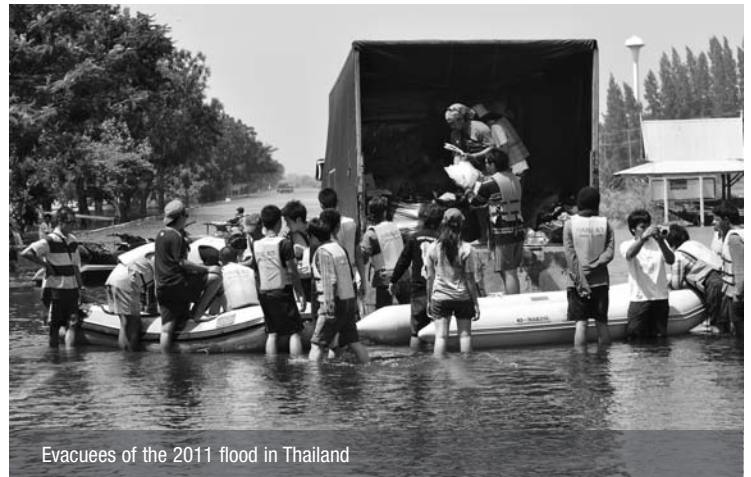
Evacuees of the 2011 flood in Thailand