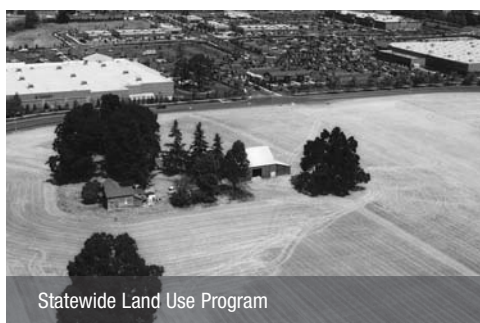
Statewide Land Use Program