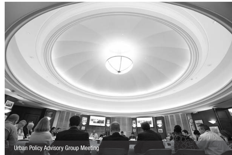
Urban Policy Advisory Group Meeting