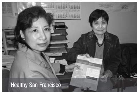
Healthy San Francisco