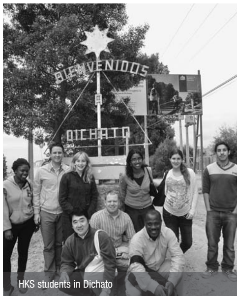
HKS students in Dichato