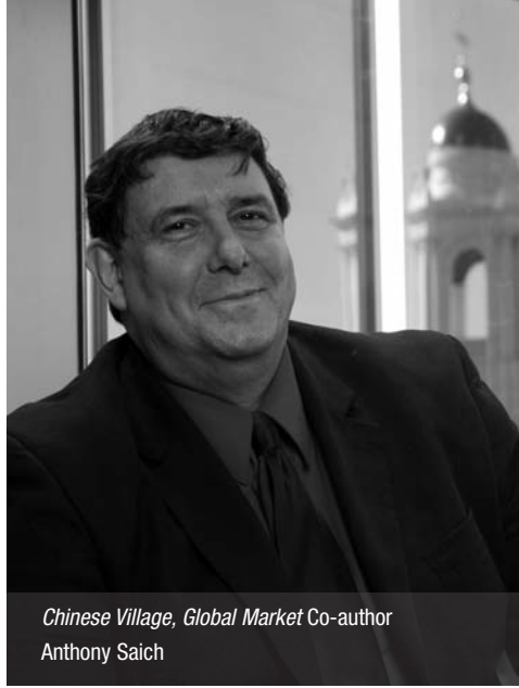
Chinese Village, Global Market Co-author Anthony Saich

Integral to Yantian's ability to attract foreign enterprise is its ample, available land. Under China's household responsibility system first instituted in 1981, individual farmers were given land use rights in exchange for providing a certain quota of their harvest. Yet,