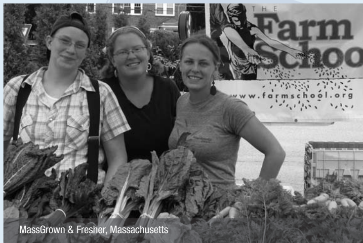
MassGrown & Fresher, Massachusetts

Still other Bright Ideas demonstrate more efficient and effective delivery of government services. Through Washington, DC's Track DC, citizens can access real-time information about city agency performance, budgets, and spending while San Francisco's Property Information Map offers an easy-to-use portal of real-time data on available properties, as well as information on zoning, permits, and previous sales prices. Programs like Washington's Connection Benefit Portal and St. Louis, Missouri's Special Needs Registry share this same model of real-time data in one, easy-to-use portal: the Special Needs Registry provides city agencies up-to-date information about special needs residents so that they can be quickly served during emergencies, and the Connection Benefit Portal allows low-income families easy access to information on available benefits and services.