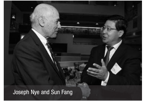
Joseph Nye and Sun Fang