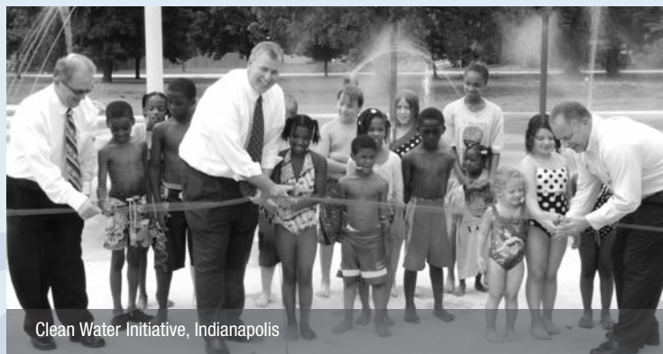
Clean Water Initiative, Indianapolis