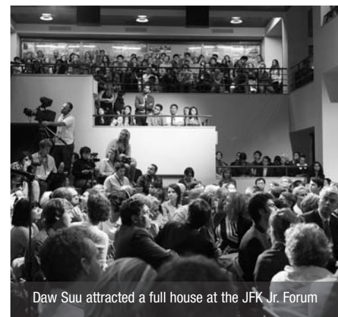
Daw Suu attracted a full house at the JFK Jr. Forum

“We have just started out on the road of shaping our country into the kind of nation we want it to be,” concluded Daw Suu. “And that means that our people have to be the kind of people capable of deciding their own destiny.”