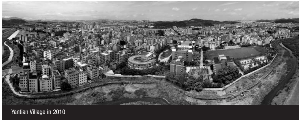
Yantian Village in 2010

The Roy and Lila Ash Center for Democratic Governance and Innovation advances excellence and innovation in governance and public policy through research, education, and public discussion. Three major programs support our mission: the Program on Democratic Governance; the Innovations in Government Program; and the Rajawali Foundation Institute for Asia. The Ford Foundation is a founding donor of the Center.