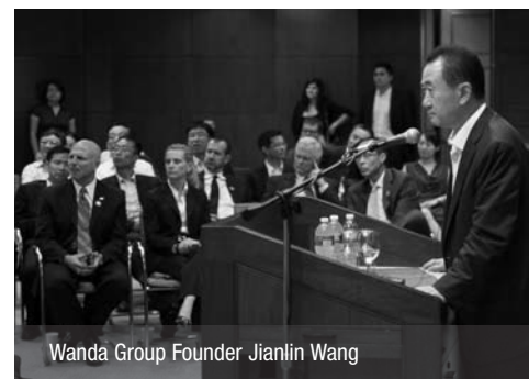
Wanda Group Founder Jianlin Wang

China Goes Global was co-sponsored by the Ash Center, Harvard Kennedy School; the Center for International Business Education and Research, Georgia Institute of Technology; Jacobs University, Bremen, Germany; and the Crummer Graduate School of Business and Rollins China Center, Rollins College, Winter Park, Florida.