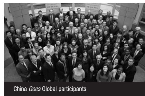
China Goes Global participants

The annual conference is part of a larger multidisciplinary initiative supporting transnational research on China's globalization which has already resulted in the publication of China Rules: Globalization and Political Transformation (Palgrave MacMillan, 2009) and special issues in the Chinese Management Studies Journal and the Thunderbird International Business Review .