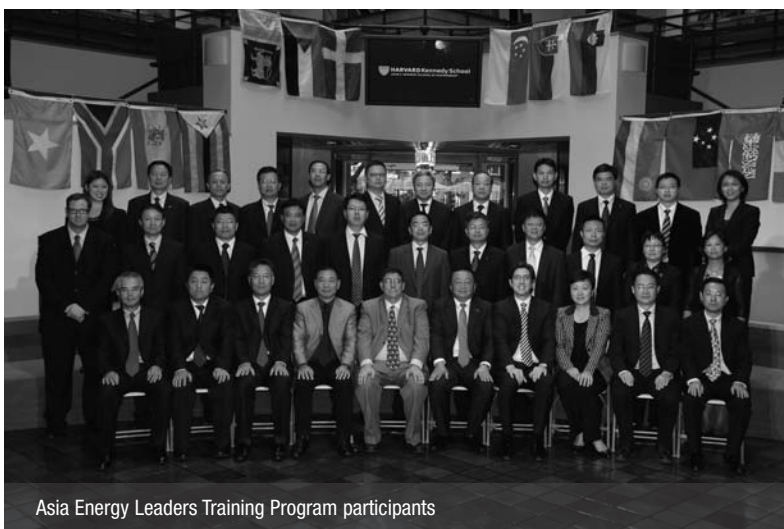
Asia Energy Leaders Training Program participants

The Asia Energy Leaders Program convenes premier faculty and senior energy executives of the Asian region to analyze emerging trends in energy technology, policy, and markets. In its first iteration, the Program designed a tailored curriculum for executives of the China Southern Grid Corporation, the second largest electricity provider in China. This three-week training program—held both in San Francisco and at Harvard Kennedy School—gave executives new frameworks and innovative approaches to understanding five key issues: globalization; energy governance and energy security; competitiveness and corporate strategy; low carbon technologies in the face of climate change; and sustainable development. In the final week of the program, lectures extended beyond energy policy to overviews of U.S. politics, institutions, and the upcoming election, as well as the U.S.-China relationship. In addition to classroom lecture and discussion, participants met with leading technology practitioners from IBM Technology and Solutions and General Electric, witnessed firsthand how solar energy can power businesses in the Sonoma Valley, and talked with energy regulators at the federal and state levels.