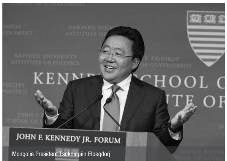
Mongolia President Tsakhiagiin Elbegdorj