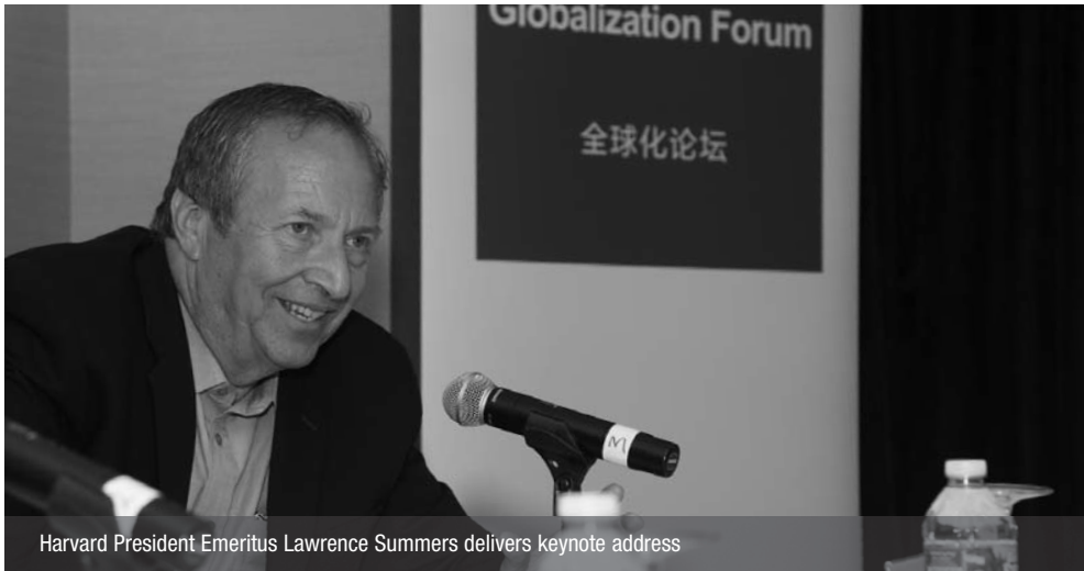
Harvard President Emeritus Lawrence Summers delivers keynote address