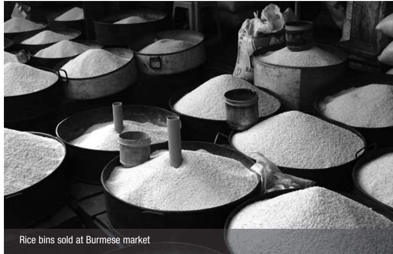
Rice bins sold at Burmese market

Farmers are struggling with lessening profitability of rice and other crops because wages, transport, and fertilizer costs continue to rise as a dollar's worth of rice yields fewer kyat. In the "Myanmar Agriculture in 2011" report, Program authors call for a stabilization of this overvalued exchange rate. While it has strengthened during the period of high inflation from 1200 kyat/$1 to 800 kyat/$1, the rate is now too strong. Through conversations with a number of stakeholders and farmers, Dapice and others have concluded that the currency must be adjusted by at least 20 to 30 percent more, so that farmers can escape this cycle of severe crop price depression.