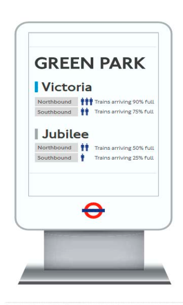
WiFi connection data could help us improve customer information for journey planning and avoiding congestion

Creating Real Business Value through Analytics The data science team at TfL seeks not only to understand data but also to create meaningful products that add business value to the organization. This requires an understanding of TfL's strategic priorities, 34 such as expanding bus service to outer London and reducing carbon emissions, as well as of the operational complexity of the network. While keeping constant communication with other divisions of TfL, a data scientist may find an insight that could be used to improve more processes. After a proof of concept to test its usefulness, a team of developers may built a software tool around it and a dashboard to measure its outcomes. One of the several product managers may