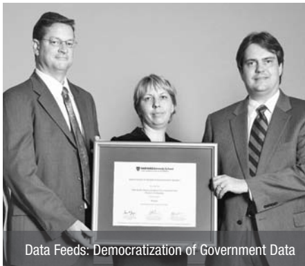
Data Feeds: Democratization of Government Data