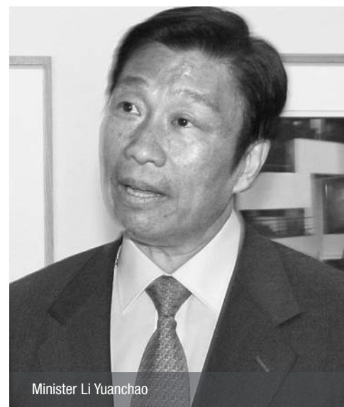
Minister Li Yuanchao

Minister Li is himself a graduate of "Leaders in Development: Managing Change in a Dynamic World." This HKS executive education training program fosters enhanced leadership skills in addressing reform, globalization, and collaboration with other countries. While attending HKS,