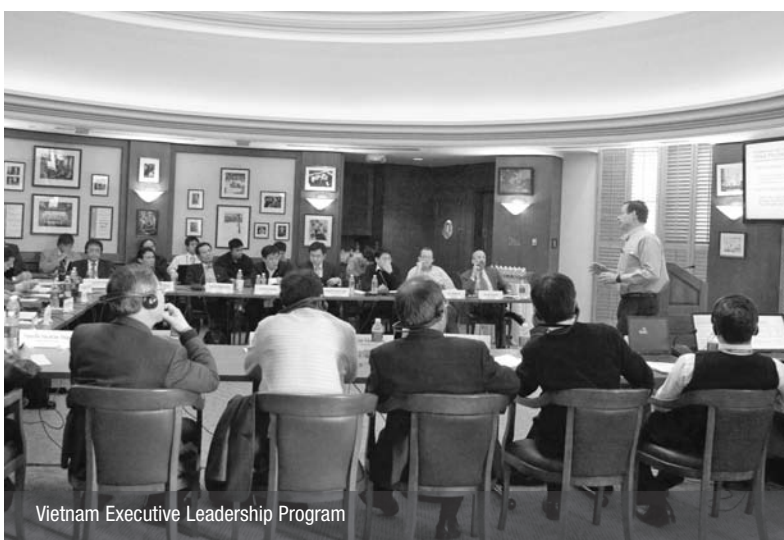
Vietnam Executive Leadership Program