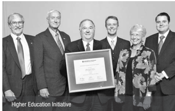
Higher Education Initiative