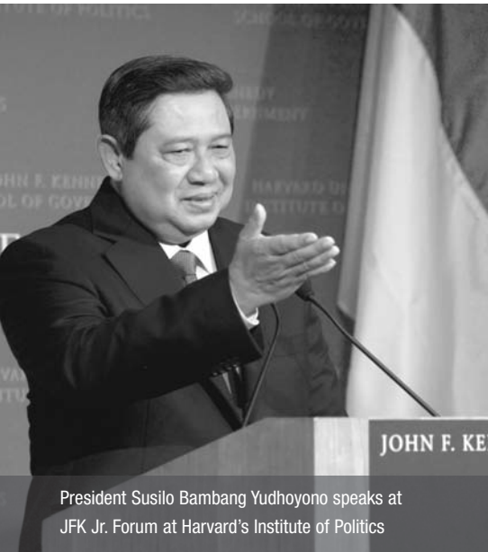
President Susilo Bambang Yudhoyono speaks at JFK Jr. Forum at Harvard's Institute of Politics