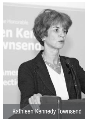
Kathleen Kennedy Townsend