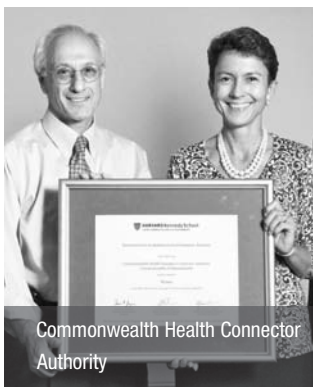
Commonwealth Health Connector Authority