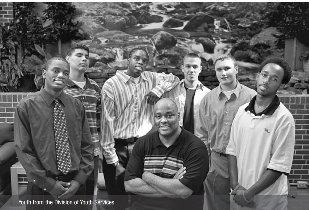
Youth from the Division of Youth Services

Recognized as “the guiding light in juvenile justice” by the American Youth Policy Forum, the Missouri Division of Youth Services (DYS) demonstrates a new philosophy in the treatment of youth offenders. While most states opt for cells, solitary confinement, and jumpsuits to reform offenders in an environment mirroring adult prisons, the DYS chooses small dormitories, group meetings, and street clothes to rehabilitate youth in a homelike setting. The program’s unique mission is to treat children as children, capable of change despite troubled backgrounds scarred by drug addictions, mental health issues, criminal records, abuse, and neglect.