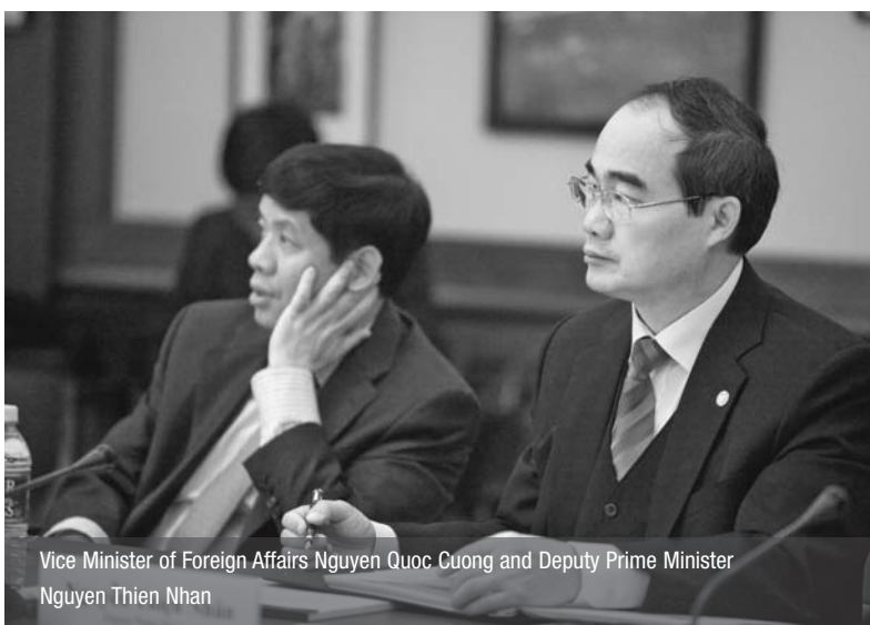
Vice Minister of Foreign Affairs Nguyen Quoc Cuong and Deputy Prime Minister Nguyen Thien Nhan