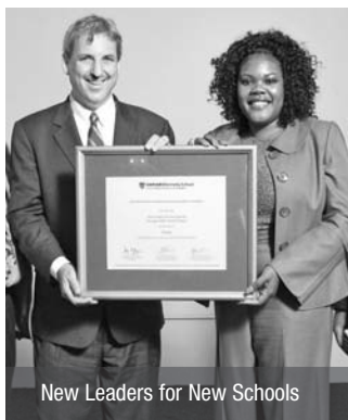
New Leaders for New Schools