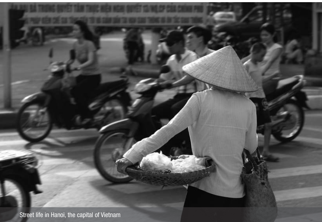
Street life in Hanoi, the capital of Vietnam