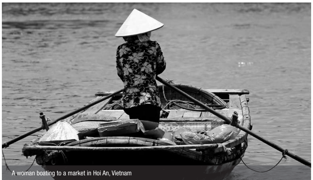
A woman boating to a market in Hoi An, Vietnam