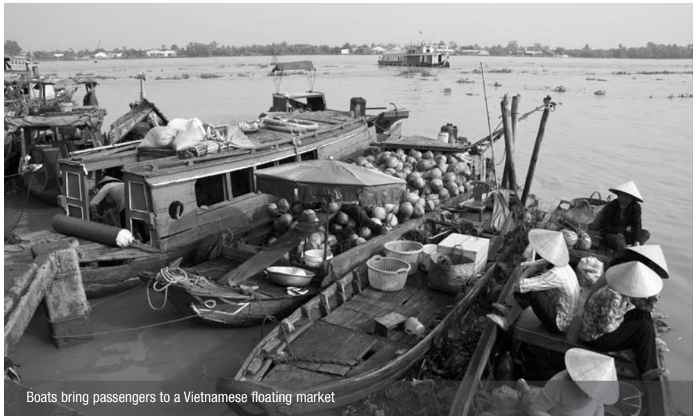
Boats bring passengers to a Vietnamese floating market

The Roy and Lila Ash Center for Democratic Governance and Innovation advances excellence in governance and strengthens democratic institutions worldwide. Through its research, education, international programs, and government innovations awards, the Center fosters creative and effective government problem solving and serves as a catalyst for addressing many of the most pressing needs of the world's citizens. The Ford Foundation is a founding donor of the Center.