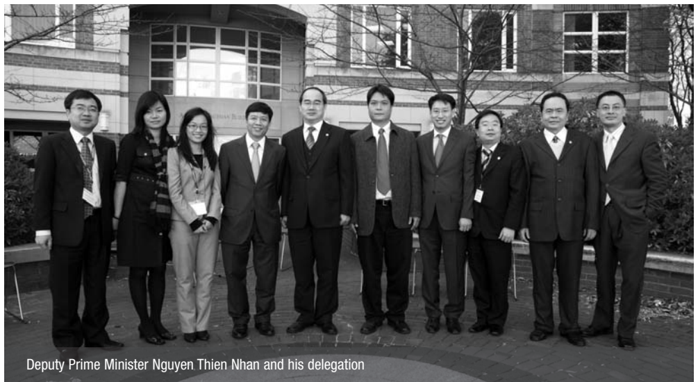
Deputy Prime Minister Nguyen Thien Nhan and his delegation