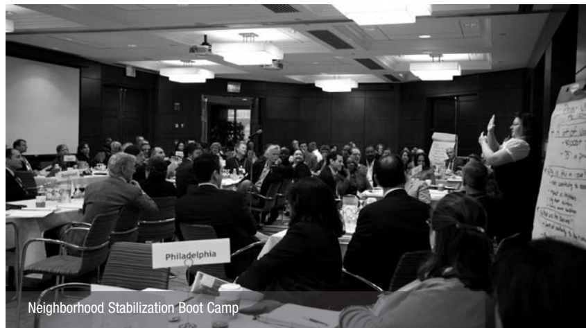
Neighborhood Stabilization Boot Camp

The neighborhood-level impacts of concentrated foreclosures can be devastating: blight, depressed property values, diminished property tax collections, and a reduction in municipal services—a negative feedback loop that repeats and worsens. In 2009 alone, foreclosures have reduced property values of nearby homes—most owned by families paying their mortgage on time—by more than $500 billion, according to the Center for Responsible Lending.