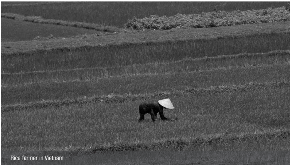
Rice farmer in Vietnam

Dapice argues that Vietnam suffers from "crony socialism," whereby powerful state enterprises unfairly win the majority of government contracts, gain easier access to cheap capital, and monopolize market share. Vietnam's shipping industry exemplifies such ingrained practices.