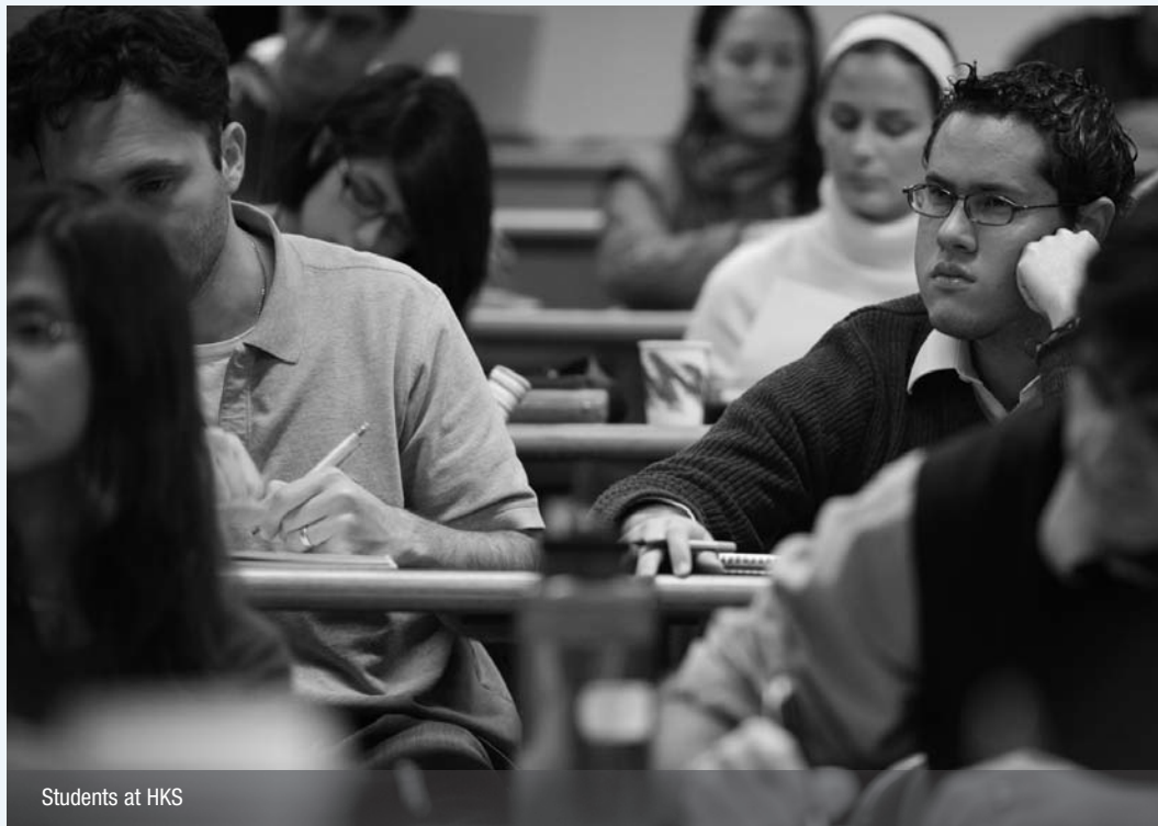
Students at HKS